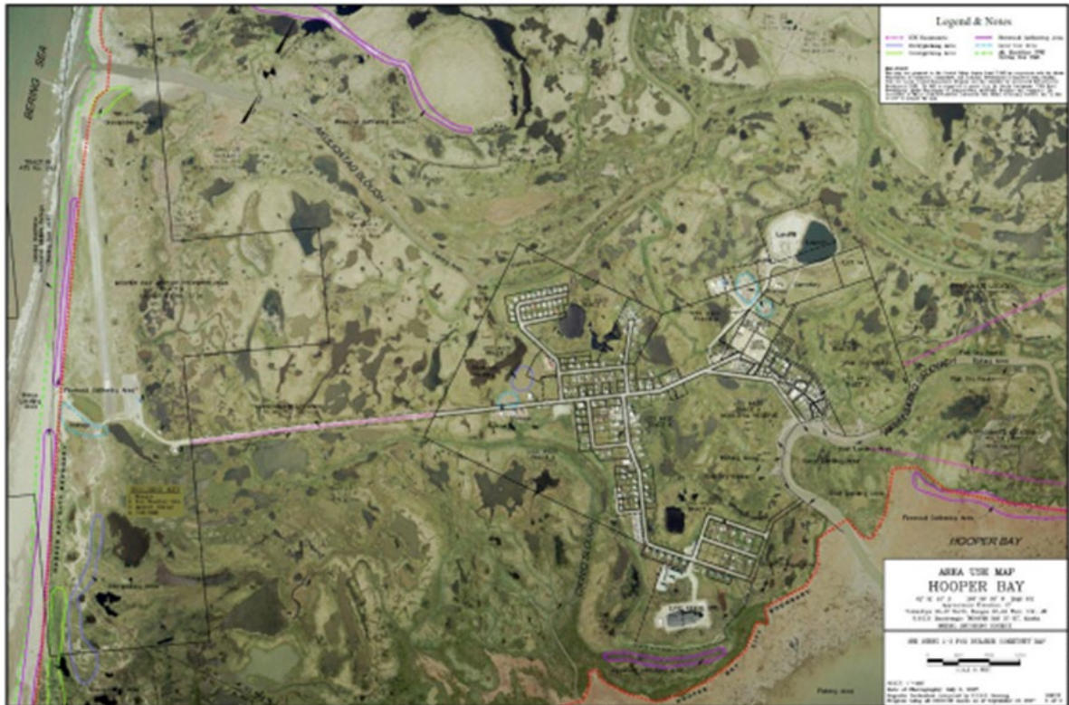
Figure 1: Hooper Bay, Alaska

Quintillion has been awarded a USDA RUS Reconnect Grant to be used for delivering a subsea fiber optic cable into Hooper Bay and then extending service to each resident with a Fiber to the Home (FTTH) solution.